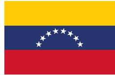
Partner Country VENEZUELA

"It was an honour for us to serve as a Partner Country, which enabled us to not only strengthen our friendly ties with the Russian Federation, but to also introduce the Russian people to our tourism opportunities and the diversity of destinations that Venezuela has to offer.