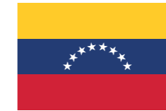
Country Partner VENEZUELA

Ministry of People's Power for Tourism of the Bolivarian Republic of Venezuela